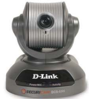
DCS-5300 Internet Camera

The built-in microphone allows you to hear what you are seeing. View and listen to what's taking place at your home or office on your web browser from anywhere in the world. You can even add an external microphone via the output jack for enhanced capturing.