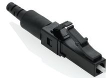
FastCAM LC OM2 Connector