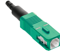
FastCAM SC/APC OS2 Connector