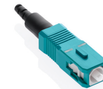
FastCAM SC OM3 Connector