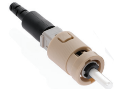
FastCAM ST OM1 Connector